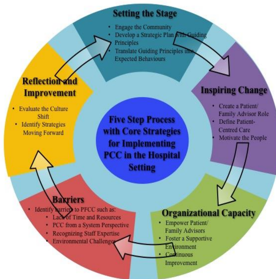
Figure 1. Five-step process for implementing PCC in the hospital setting

Once the Guiding Principles were in place, this provided a clear direction for the hospital. This is consistent with findings from previous healthcare studies, which identified planning and the development of a strategy and Guiding Principles as a key success factor in organizational change. 50-52 The strategic plan was operationalized, as tangible behaviours were developed and linked to the Guiding Principles outlined through the strategic planning process. This allowed the organization to develop a vision with future directions, 50 which encouraged goal alignment